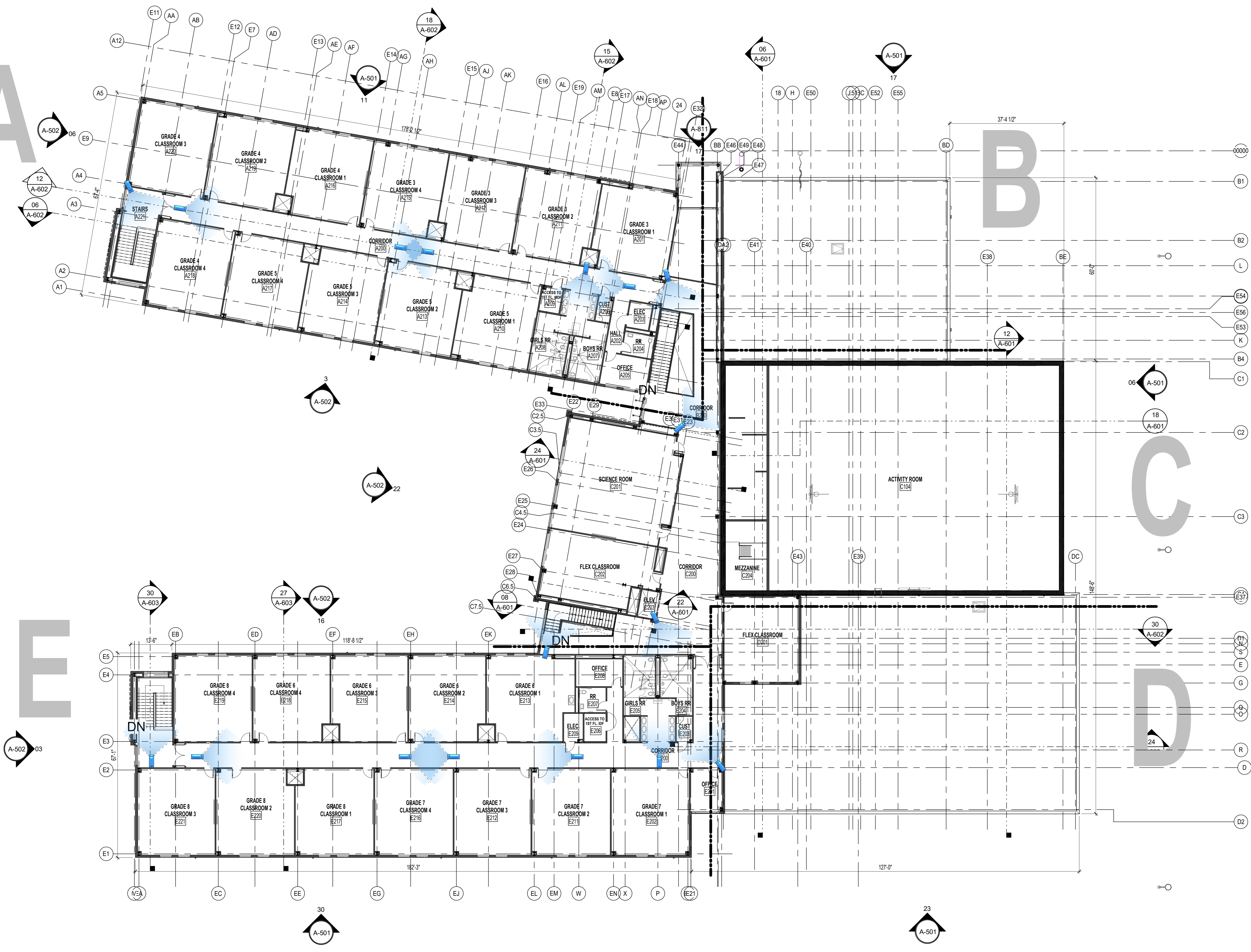
06 2ND LEVEL - FLOOR PLAN - COMPOSITE 1/16" = 1'-0"